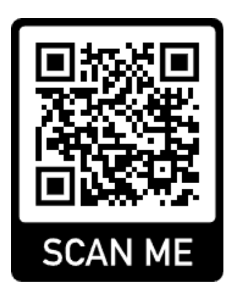
View Course Catalog on Phone

** Some courses are delivered by mobile training teams and you can find the training locations on our <u>course schedule</u>: (CaC login required)